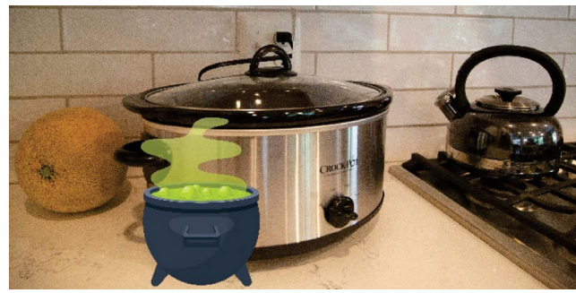
cooking meals on the stovetop.

Get rid of goosebumps by eliminating ghostly drafts. The winter chill is just around the corner, so Small countertop appliances like slow cookers use less energy than now is the time to seal air leaks around your home. Apply caulk and weatherstripping around drafty